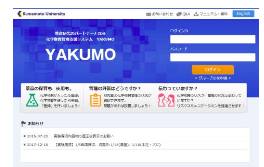
Figure 2-3 YAKUMO start screen

The University Rules require that chemical substances possessed by Groups be registered in YAKUMO (Article 9 of the Rules).